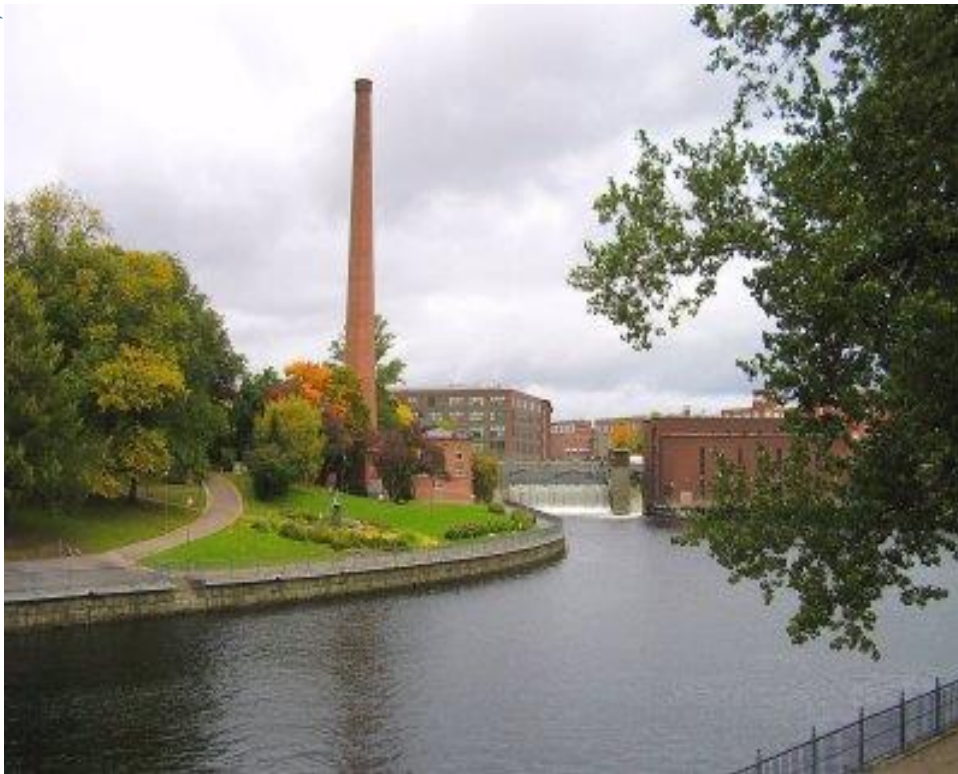
Centre of Tampere