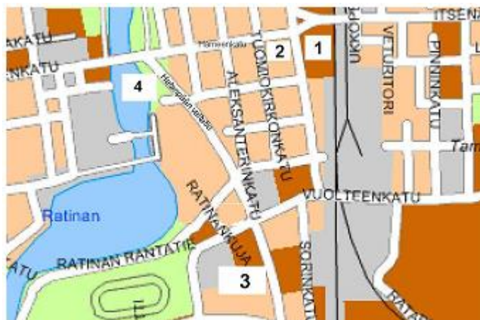
Picture 1; 1: Railway station, 2: Bus stop in front of the railway station, 3: Bus station and a bus stop, 4: Another bus stop

When in Tampere, you will probably find yourself either from the bus station or the railway station (check the map below). Get on the bus number 3, 4, 20 or 13 that will take you to Hervanta - our part of the city. A single ticket costs 2,6 euros, and you can buy it directly from the bus driver. If you are uncertain about where to get off, ask the other passengers and somebody will be happy to help.