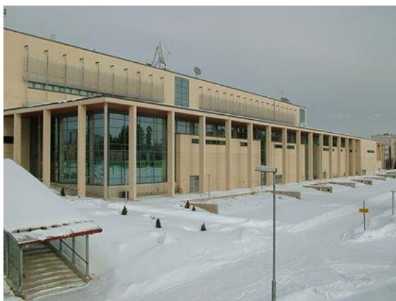
Tietotalo in winter (one of the buildings at TUT)

Tampere University of Technology (Tampereen Teknillinen Yliopisto) was founded in 1965. With twelve student degree programmes and about 40 academic departments and units, TUT offers a wide spectrum of technological knowledge and skills. There are currently more than 12000 students. ( http://www.tut.fi )