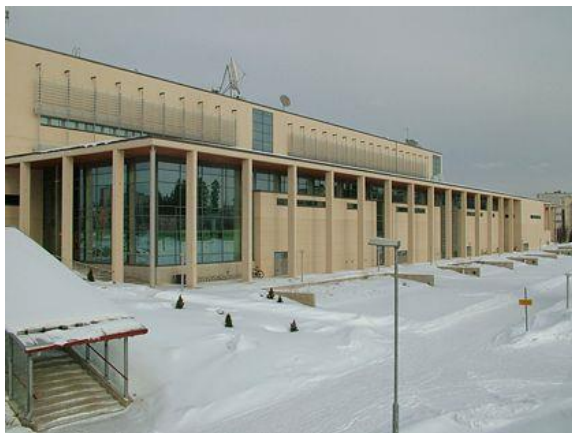
Tietotalo in winter (one of the buildings at TUT)

Tampere University of Technology (Tampereen Teknillinen Yliopisto) was founded in 1965. With twelve student degree programmes and about 40 academic departments and units, TUT offers a wide spectrum of technological knowledge and skills. There are currently more than 12000 students. ( http://www.tut.fi )