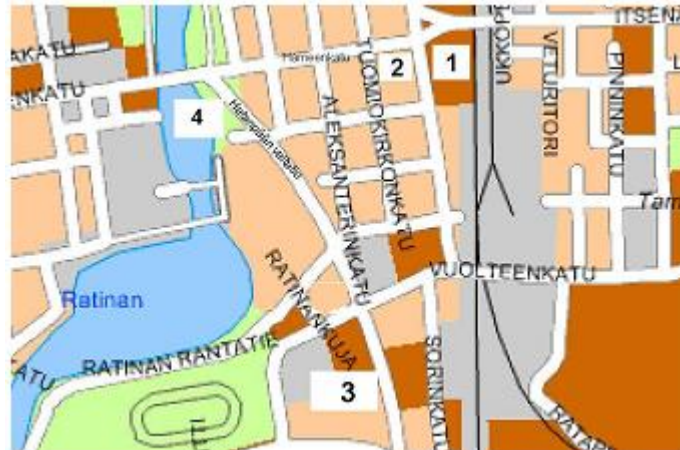
Picture 1; 1: Railway station, 2: Bus stop in front of the railway station, 3: Bus station and a bus stop, 4; Another bus stop

When in Tampere, you will probably find yourself either from the bus station or the railway station (check the map below). Get on the bus number 3, 4, 20 or 13 that will take you to Hervanta - our part of the city. A single ticket costs 2,6 euros, and you can buy it directly from the bus driver. If you are uncertain about where to get off, ask the other passengers and somebody will be happy to help.